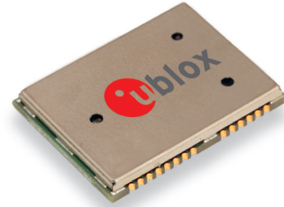
LEA-6: 17.0 x 22.4 x 2.4 mm